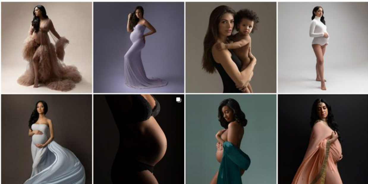
glow portraits: №3 Maternity Photographer in New York

glow portraits specializes in maternity and newborn photography, and their studio is located in Midtown Manhattan. They offer a variety of packages that include both indoor and outdoor sessions.